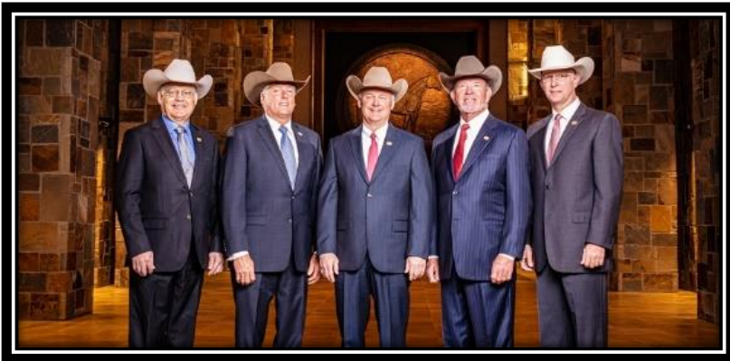
SPECIAL GUESTS: SELECT AQHA EXECUTIVE COMMITTEE MEMBERS